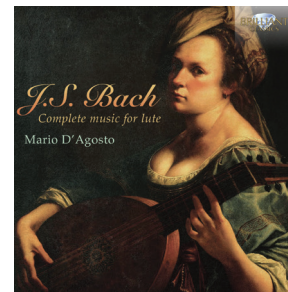
J.S. Bach Complete Music for Lute 94408 2CD