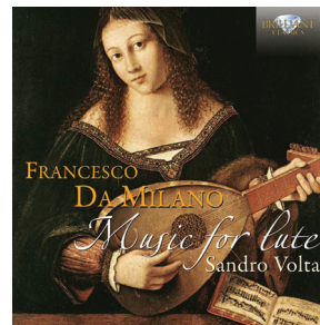
Da Milano Music for Lute 94993 1CD