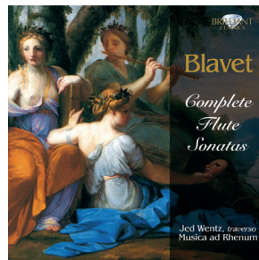
Blavet Complete Flute Sonatas 93003 3CD