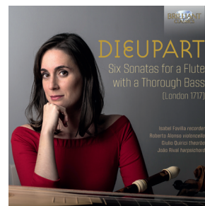
Dieupart Six Sonatas for a Flute with a Thorough Bass 95572 1CD